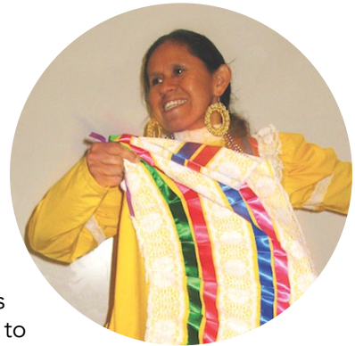
Catalina Lacy Upper School Spanish Teacher 1991 – 2022